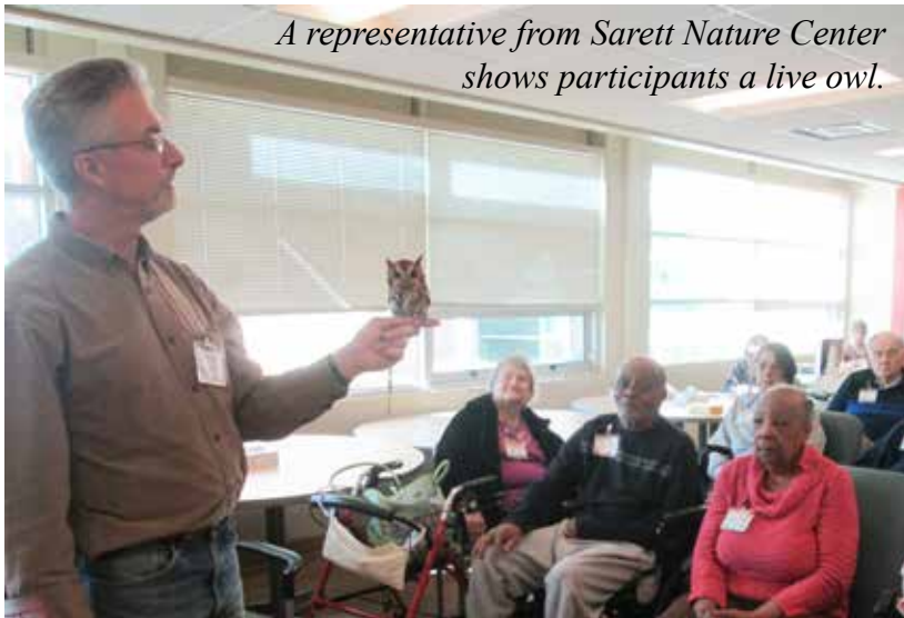
A representative from Sarett Nature Center shows participants a live owl.