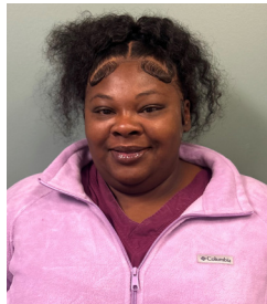
Charnisea Lusk Day Center CNA