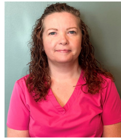
Cheryl Marsh Day Center CNA