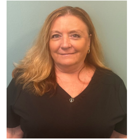
Cindy Short Day Center CNA