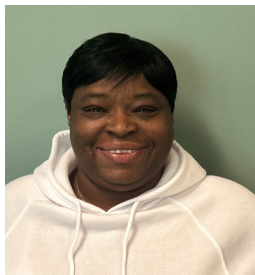
Monique Taylor Day Center CNA